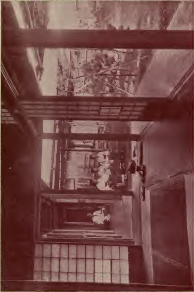
A JAPANESE INTERIOR.